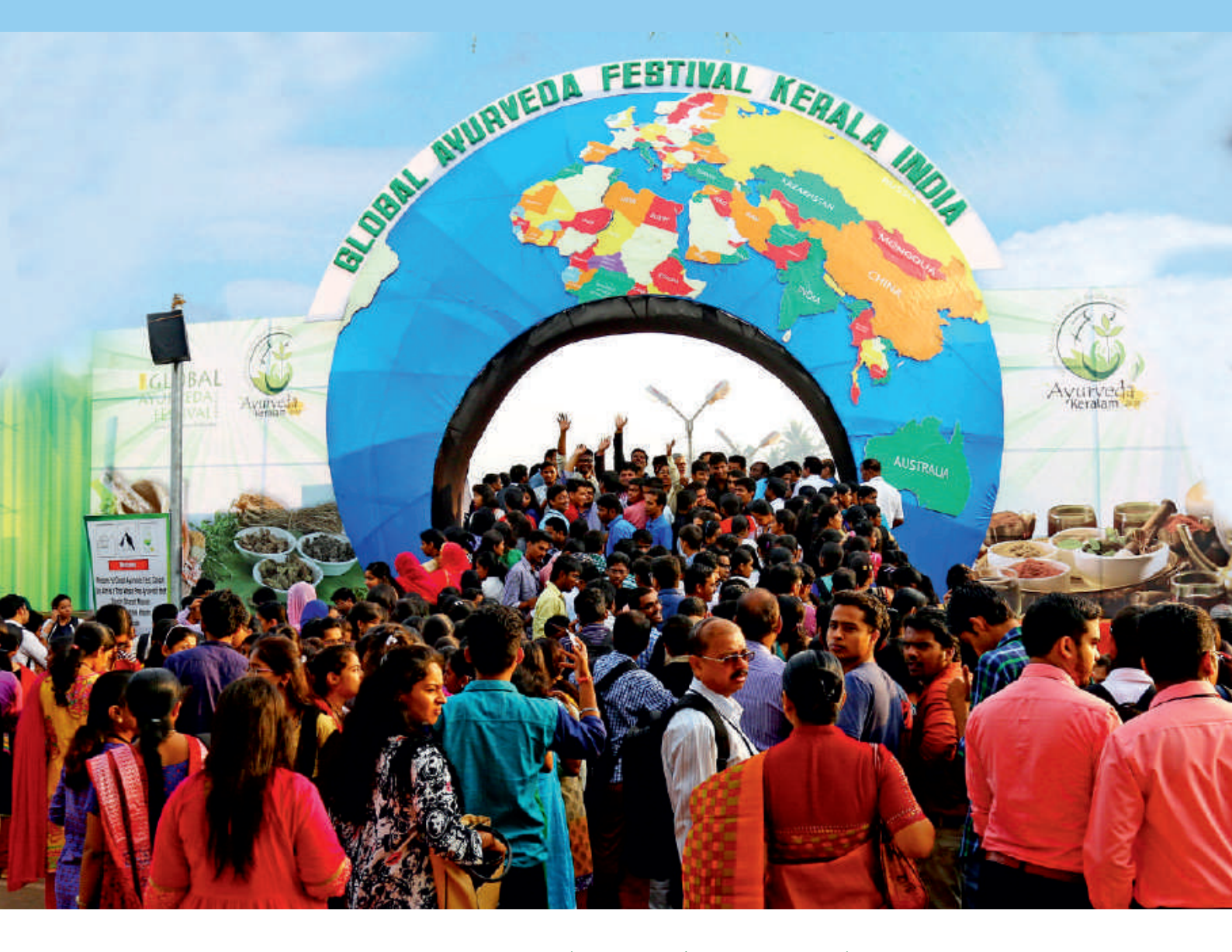
For Sponsorship and Partnership opportunities and privileges please visit www.gafindia.org