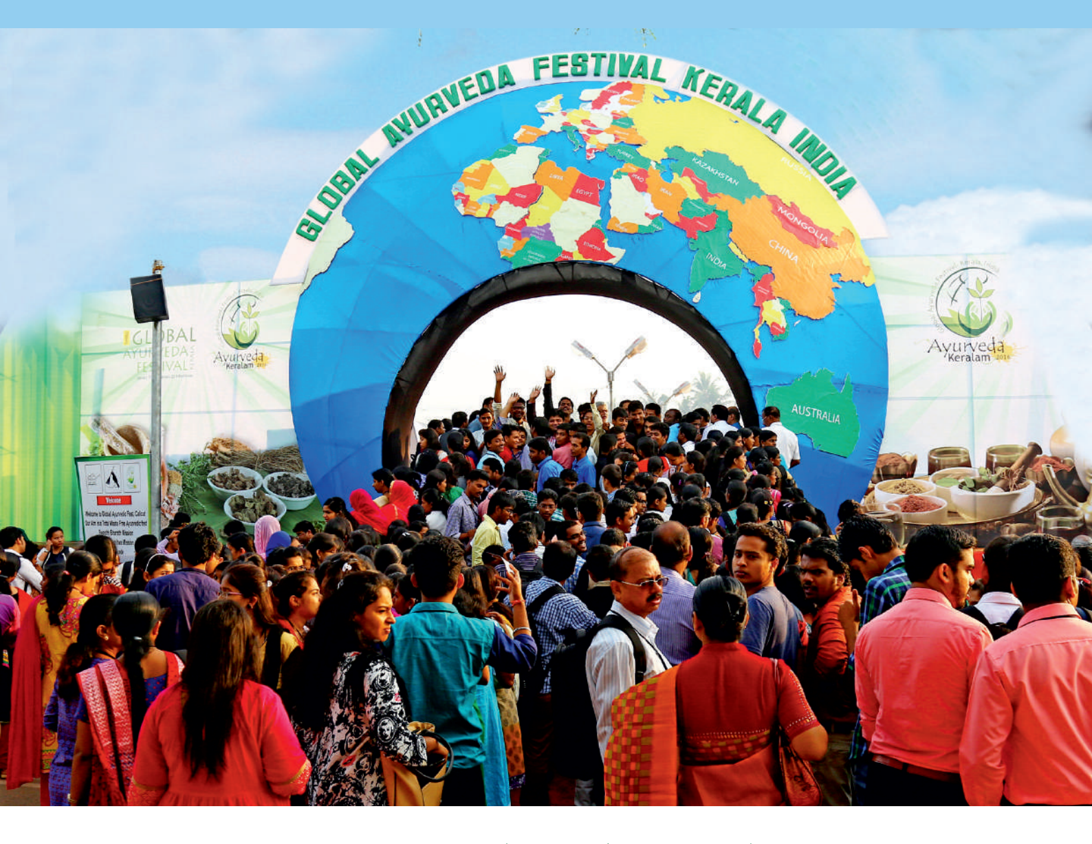
For Sponsorship and Partnership opportunities and privileges please visit www.gafindia.org